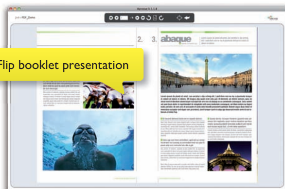
Flip booklet presentation