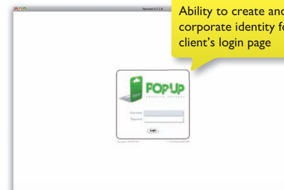
Ability to create and match corporate identity for your client's login page